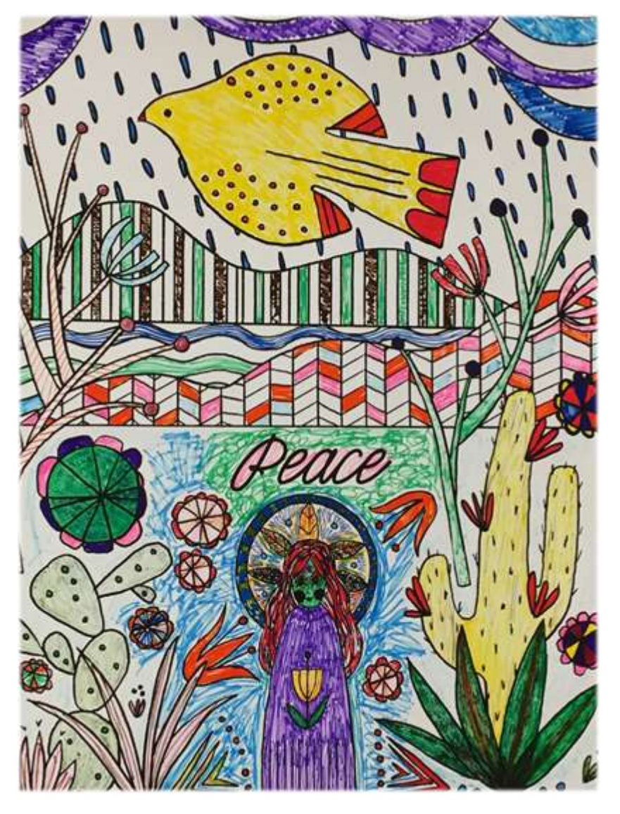
THE COMMUNITY CHURCH OF SEBASTOPOL UNITED CHURCH OF CHRIST

1000 Gravenstein Hwy North 50 707.823.2484 50 www.uccseb.org