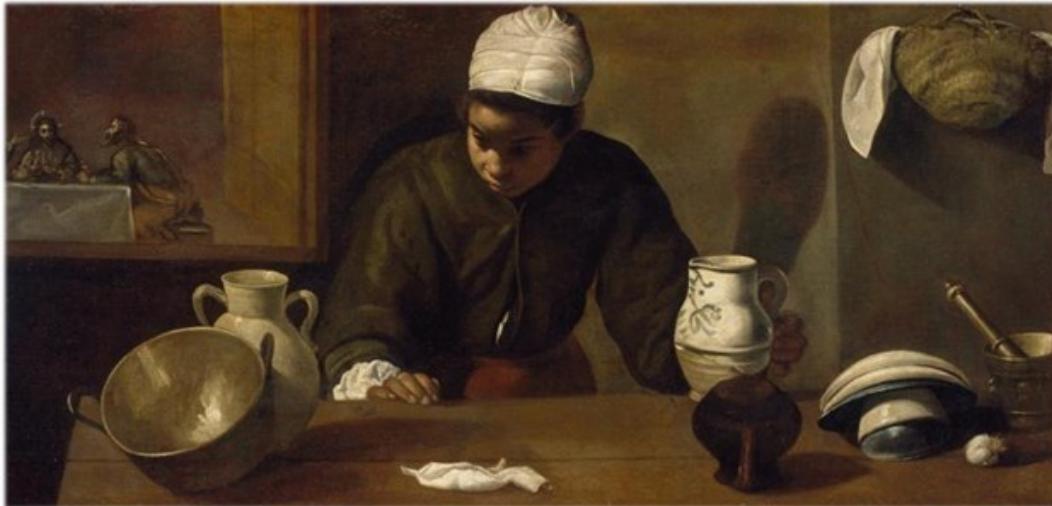
Diego Velázquez (1599-1660), 'Kitchen Maid with the Supper at Emmaus', c.1617-1618.