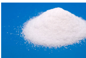
SPECS OF LIGHT