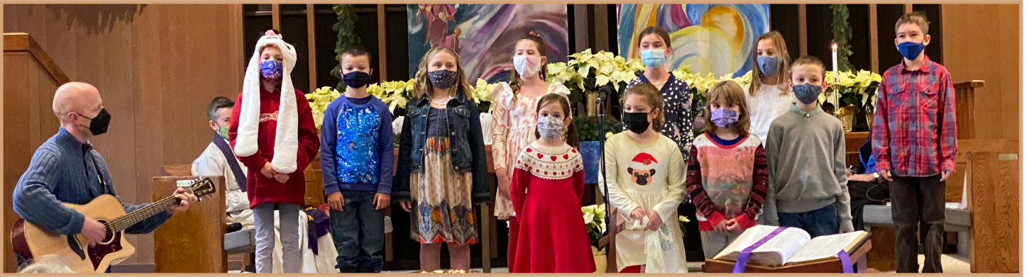
The Advent Children's Choir sang the song Emmanuel during the offering at the Fourth Sunday in Advent. ❁

Advent is always a busy season for the church, but it seemed especially more so since we have started to emerge from a long pandemic induced confinement.