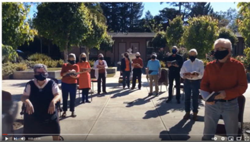
Hymn: "Every Time I Feel the Spirit" 23 views • May 20, 2021

We're approved for groups to sing together, outdoors, distanced, fully vaccinated, and with special singers' masks! Beginning mid-May, about a dozen of us have been doing just that and we are elated. The group is comprised of singers from the Chancel Choir, and other singers who have participated in the videos we've been using. Some singers from the Choir are not ready to join in yet for various reasons, and in respect for them, we're referring to this group with a temporary moniker: "The Singers In The Wild."