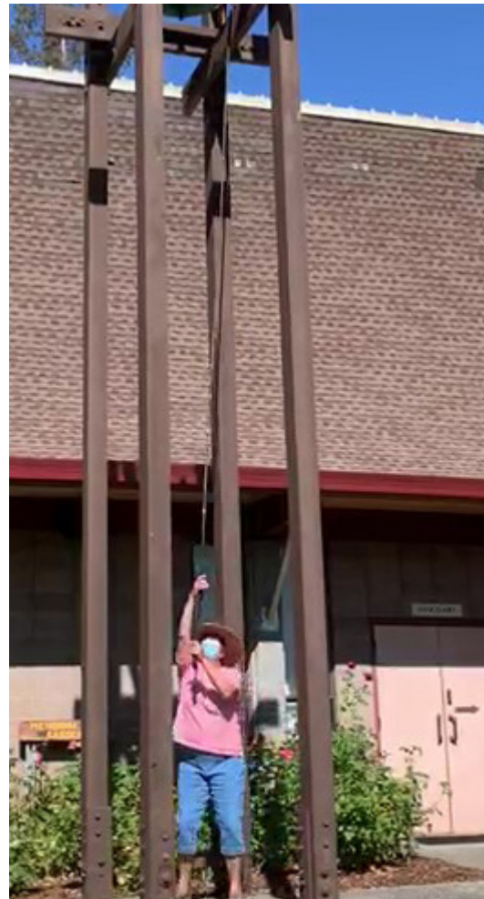
Ringling the bell to commemorate the atomic bombings on Hiroshima and Nagasaki