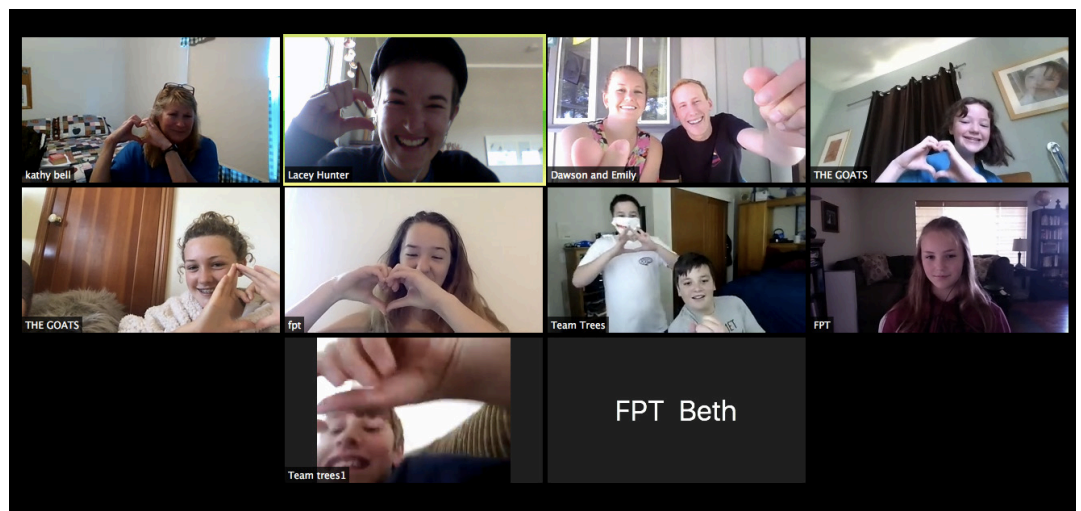
Middle School zoom

Middle and High School youth groups gather on Zoom for Camp Caz games