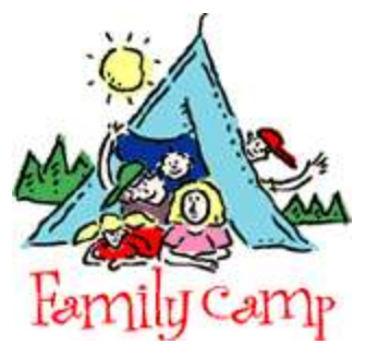
All Ages Welcome!