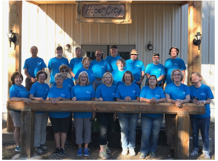
Two previous disaster recovery work groups.