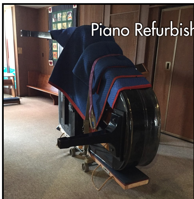
Piano Refurbishment and Special Concert