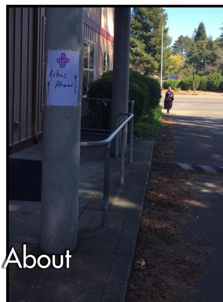
Lent Begins...Ashes Out and About