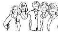
Women's Choral Group